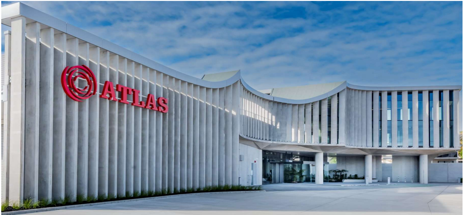
This photo shows an example of a building constructed with ready mix concrete

Ready Mix Concrete 25 MPa 10mm Structural Pump 86 Omaha Valley Road, Big Omaha