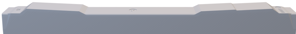
Figure 1. GS-225-22D Concrete sleeper – fastenings and shoulders not shown

The GS-225-22D is a standard gauge / broad gauge dual gauge sleeper with a step between the rail seats giving it "common top of rail (CTOR)", meaning that all the rails are the same height. This distinguishes it from any other standard gauge / broad gauge dual gauge sleepers we have made previously where the broad gauge rail is about 8mm higher than the standard gauge rail. It also uses a unique, custom designed dual gauge shoulder.