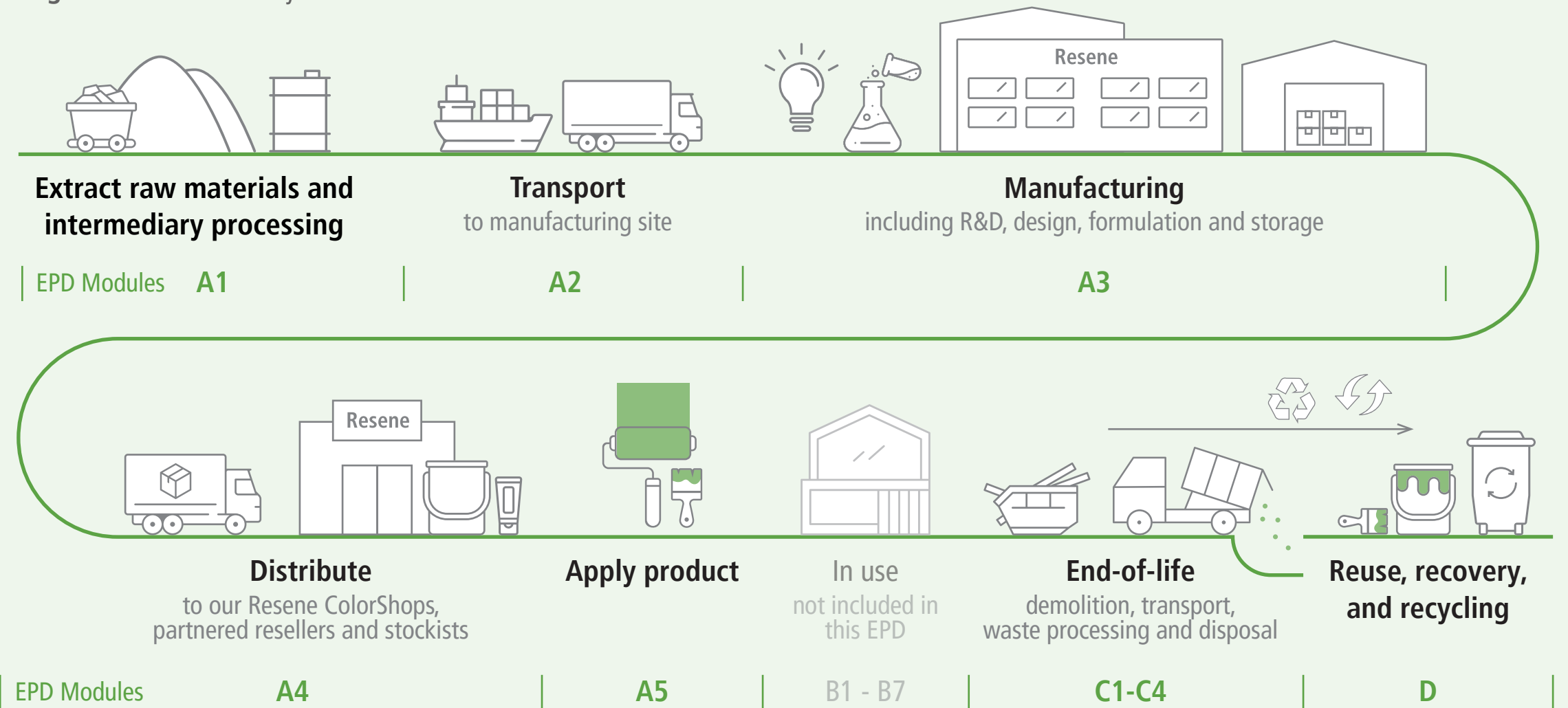
Figure 1. Product life cycle and EPD modules