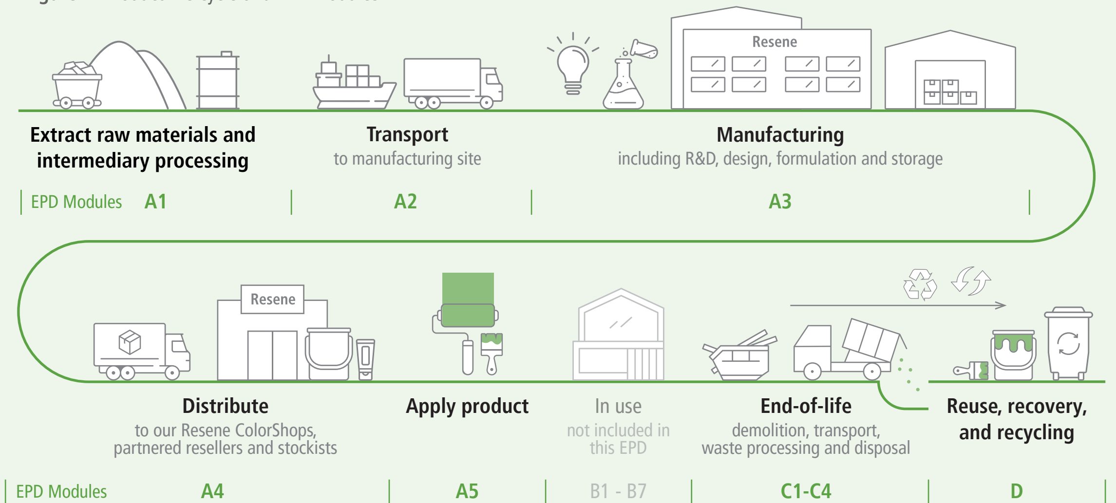
Figure 1. Product life cycle and EPD modules