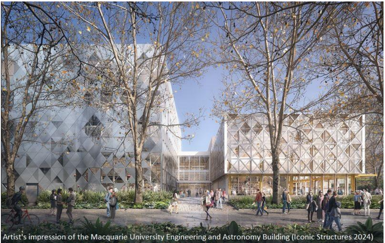
Artist's impression of the Macquarie University Engineering and Astronomy Building (Iconic Structures 2024)

Programme: The International EPD® System www.environdec.com