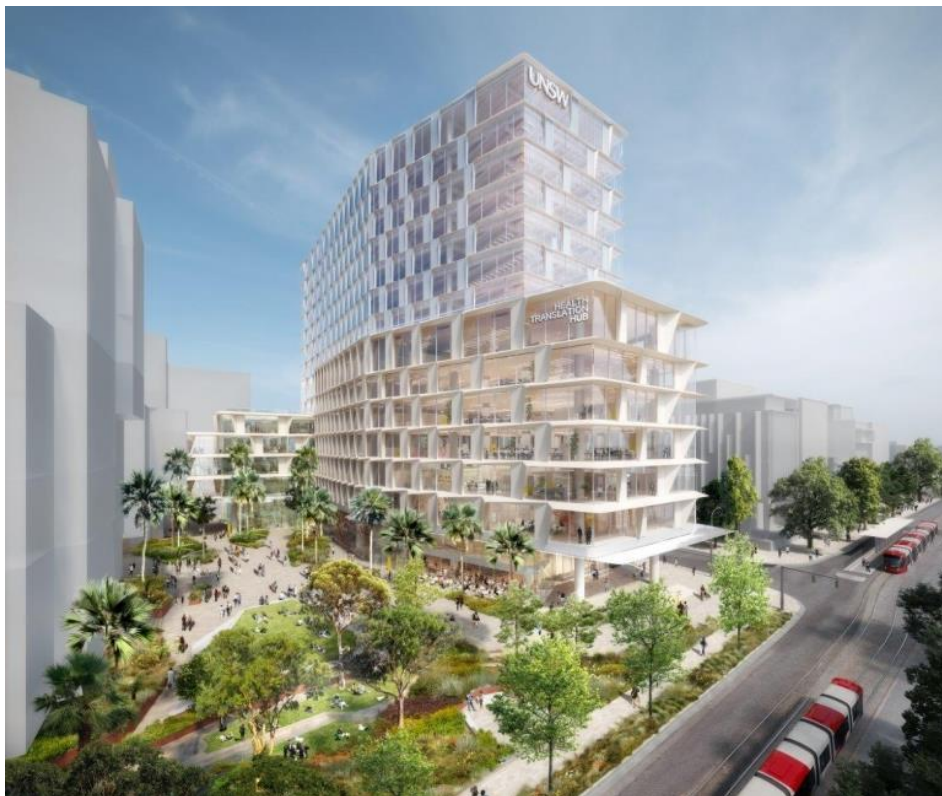
Artist's impression of the UNSW Health Translation Hub building (UNSW 2024)

Programme: The International EPD® System www.environdec.com