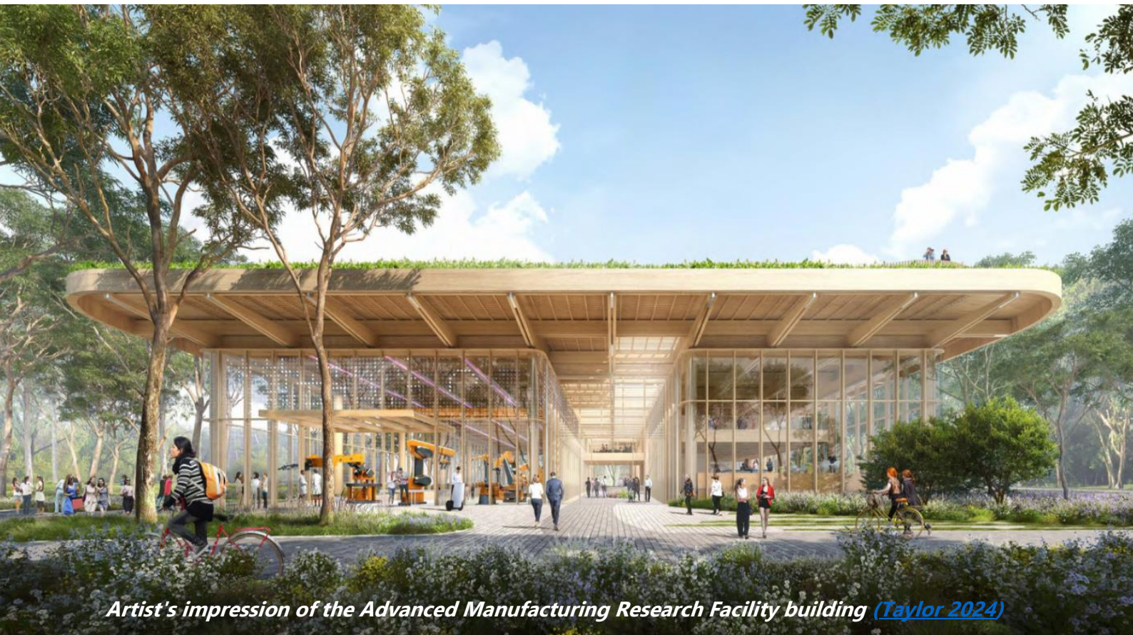
Artist's impression of the Advanced Manufacturing Research Facility building (Taylor 2024)

EPD Registration no. S-P-10952 | Version 1.0