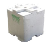
6IB-600EstdP-G 600 Standard Block 600x600x600mm 500kg