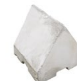
6IB-600ECapP-G 600 Capper Block 600x600x600mm 290kg