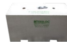
6IB-1200EFtP-G 1200 Flat Top Block 600x600x1200mm 1000kg