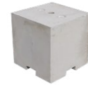
6IB-600EFtP-G 600 Flat Top Block 600x600x600mm 500kg