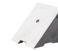
6IB-600EAngP-G 600 Angle Block 600x600x600mm 250kg