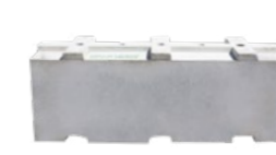
6IB-1800EstdP-G 1800 Standard Block 600x600x1800mm 1500kg