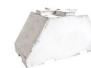
6IB-1200EBaseP-G 1200 Base Block 600x600x1200mm 810kg