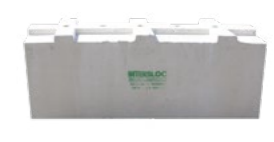
6IB-1800EFbP-G 1800 Flat Bottom Block 600x600x1800mm 1500kg