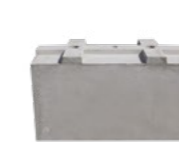
6IB-1200EFbP-G 1200 Flat Bottom Block 600x600x1200mm 1000kg