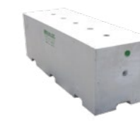
6IB-1800EFtP-G 1800 Flat Top Block 600x600x1800mm 1500kg