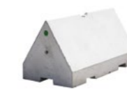
6IB-1200ECapP-G 1200 Capper Block 600x600x1200mm 580kg