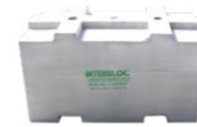
6IB-1200EstdP-G 1200 Standard Block 600x600x1200mm 1000kg