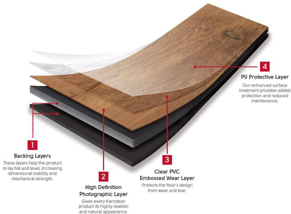
Diagram 1: Structure of the product

Vinyl tile is made primarily from calcium carbonate (limestone), polyvinyl chloride, plasticizers, additives (i.e., pigments and stabilizers). It is structured with five layers: two PVC backing layers, one high definition photographic layer, one clear PVC embossed wear layer and a final PU protective layer.